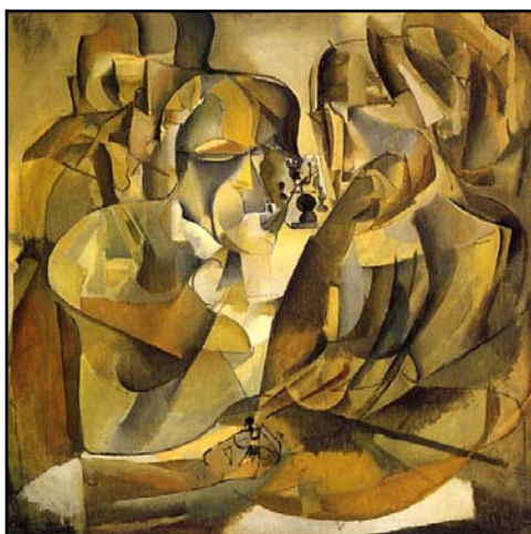
"Portrait of Chess Players"

Nd7 17.Ne1 Nf6 18.Bf3 Qe8 19.dxc5 Qc6 20.Bxf6 Bxf6 21.Bxe4 Qxe4 22.Qxd6+ Kf7 23.Rd1 Be5 24.Qd3 Qh4 25.f4 Rad8 26.Qe2 Rxd1 27.Qxd1 Rd8 28.Qe2 Bc3 29.Nf3 Qf6 30.cxb6 axb6 31.Rd1 Rxd1+ 32.Qxd1 Bb4 33.Ne5+ Kg7 34.Qd7+ Kh6 35.g4 Qe7 36.g5+ Kg7 37.Kf2 Kf8 38.Qc8+ Kg7 39.Nc6 Qd6 40.Nd4 Kf7 41.Qh8 Ba5 42.Qxh7+ Ke8 43.Qg6+ Ke7 44.Qf6+ Kd7 45.Qf7+ Kd8 46.Qxe6 Be1+ 47.Kxe1 Qb4+ 48.Ke2 Qc3 49.Nc6+ Kc7 50.Qe5+ 1-0